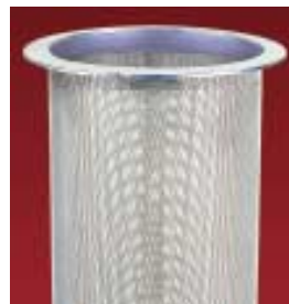
Model RP Replaces Ronningen-Petter baskets 224, 324, 424, 152