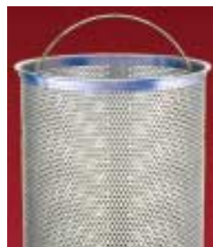
Model CU Replaces Cuno baskets 7PC1, 7PC2