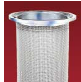
Model AFF/GAF Replaces American Felt & Filter/GAF baskets 112, 122, AMS R, AMC R, NCX, RBX 1L, RBX 2L