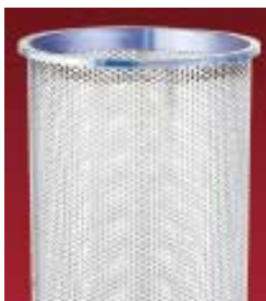
Model CF Replaces Commercial Filter baskets SB11, SB12