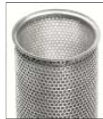
With wire mesh lining

PERFORATED WITH WIRE MESH LINING STRAINER AND FILTER BAG BASKETS: Stainless steel wire is used in mesh sizes 30, 60, 100, 150, or 200. When used as a bag filter basket, the following advantages are realized: