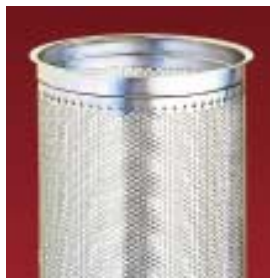
Model FF Replaces Filtration Systems baskets 112, 122