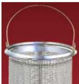
Model STR Replaces Strainrite baskets UF1-90, UF1-180